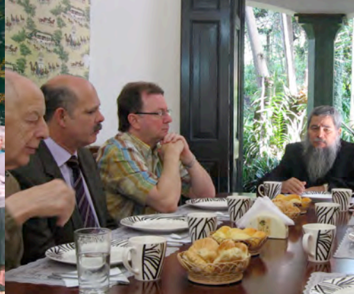
(Medellin, 2006: Workshop for the Colombian ELN Leadership**)