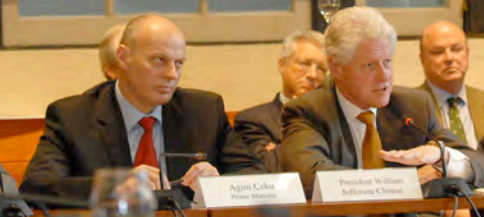
(Pocantico, 2007: Strategy Session for Kosovar Leaders*)

Pocantico Conference Center April 12-14, 2007