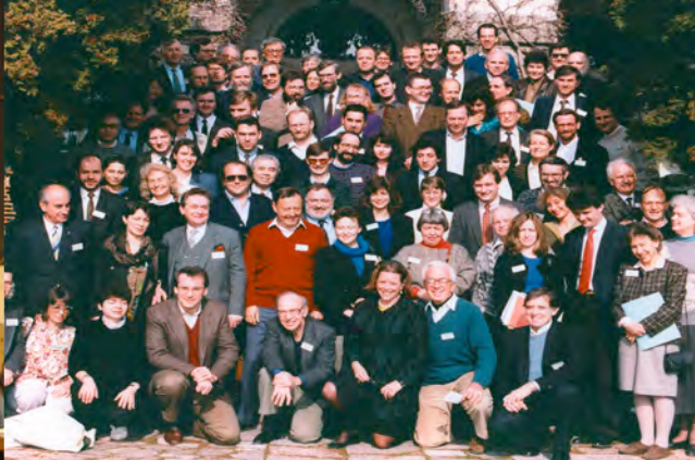
(Salzburg, 1992: Founding Meeting of the Project)